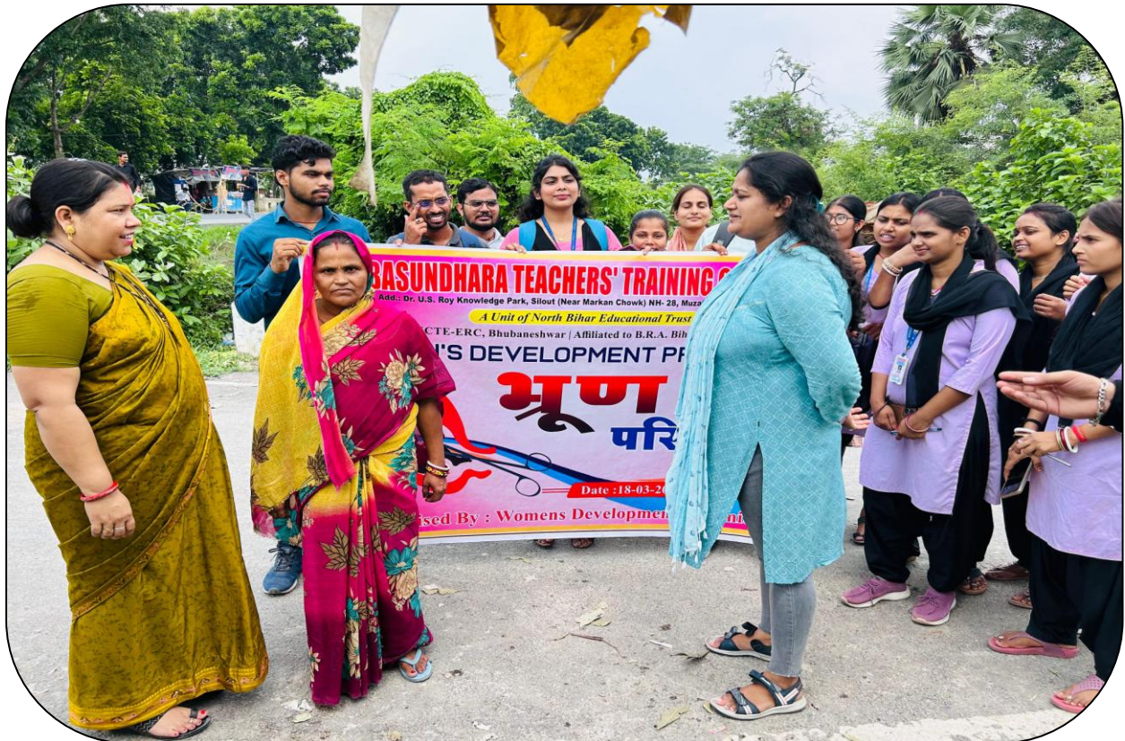
Students interacting with villagers during awareness rally programme on March 18, 2023

Awareness March: Participants marched from the BTTC gate to the nearby village, chanting slogans such as "Ethical Testing, Informed Decisions" and "Respect Life, Respect Ethics." The march aimed to highlight the importance of ethical considerations in medical practices and the need for community awareness about embryo testing.