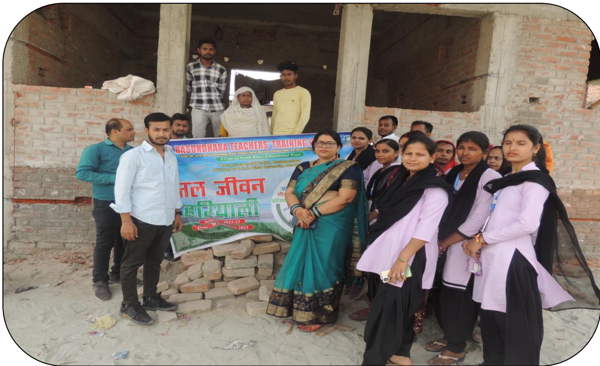
Students making awareness around villages for awareness rally 28-02-2023