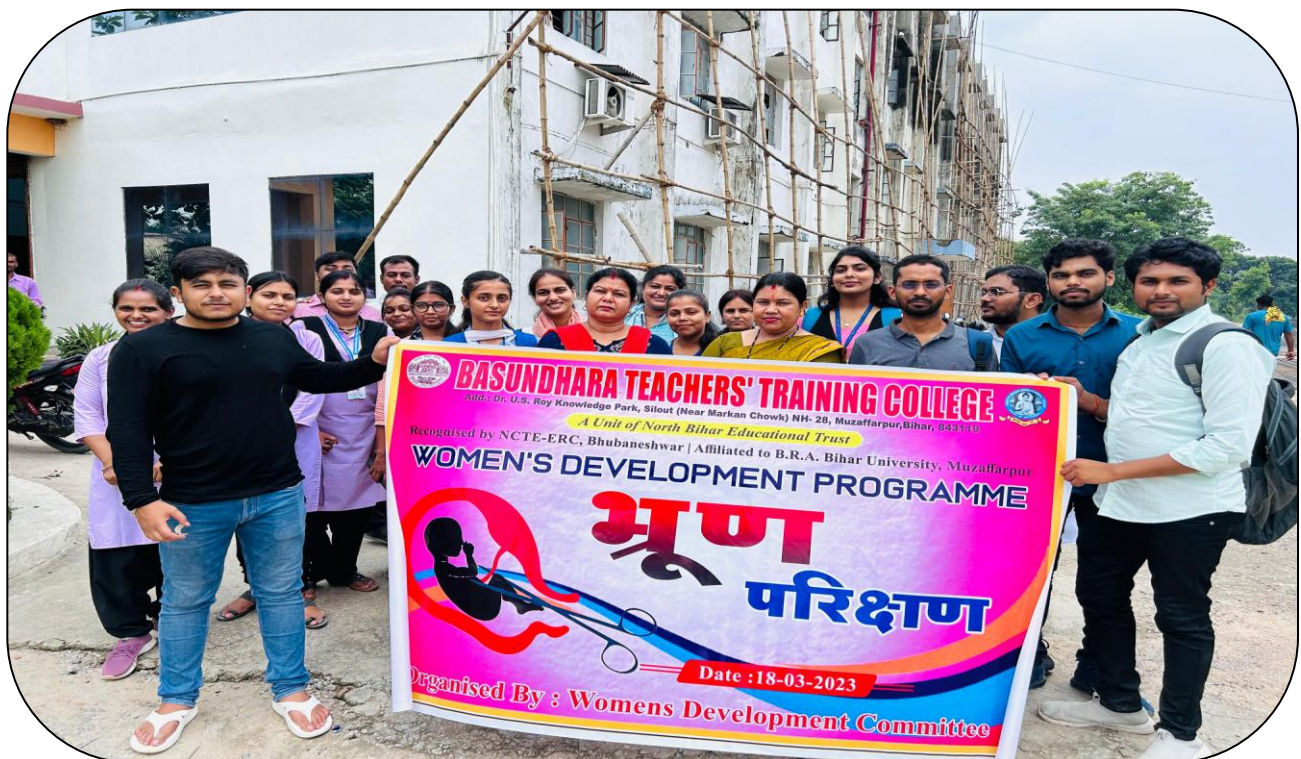
Students and faculty just before rally on March 18, 2023

Today on March 18, 2023, Basundhara Teacher Training College (BTTC) organized an impactful rally to raise awareness about embryo testing, its ethical considerations, and its implications. The rally, lead by the BTTC, aimed to educate the community on the significance of ethical practices in medical procedures and the importance of informed decision-making. The rally began at the BTTC gate and proceeded to the nearby village, with active participation from students, faculty members and local residents. The rally commenced at 10:00 AM from the BTTC gate. Participants assembled early, carrying banners, placards, and informational materials on embryo testing and ethical medical practices. Dr. Sheo Prakash Dwivedi, the Principal of BTTC, inaugurated the event with an enlightening speech that emphasized the importance of understanding the ethical dimensions of medical technologies and the role of education in promoting informed choices.