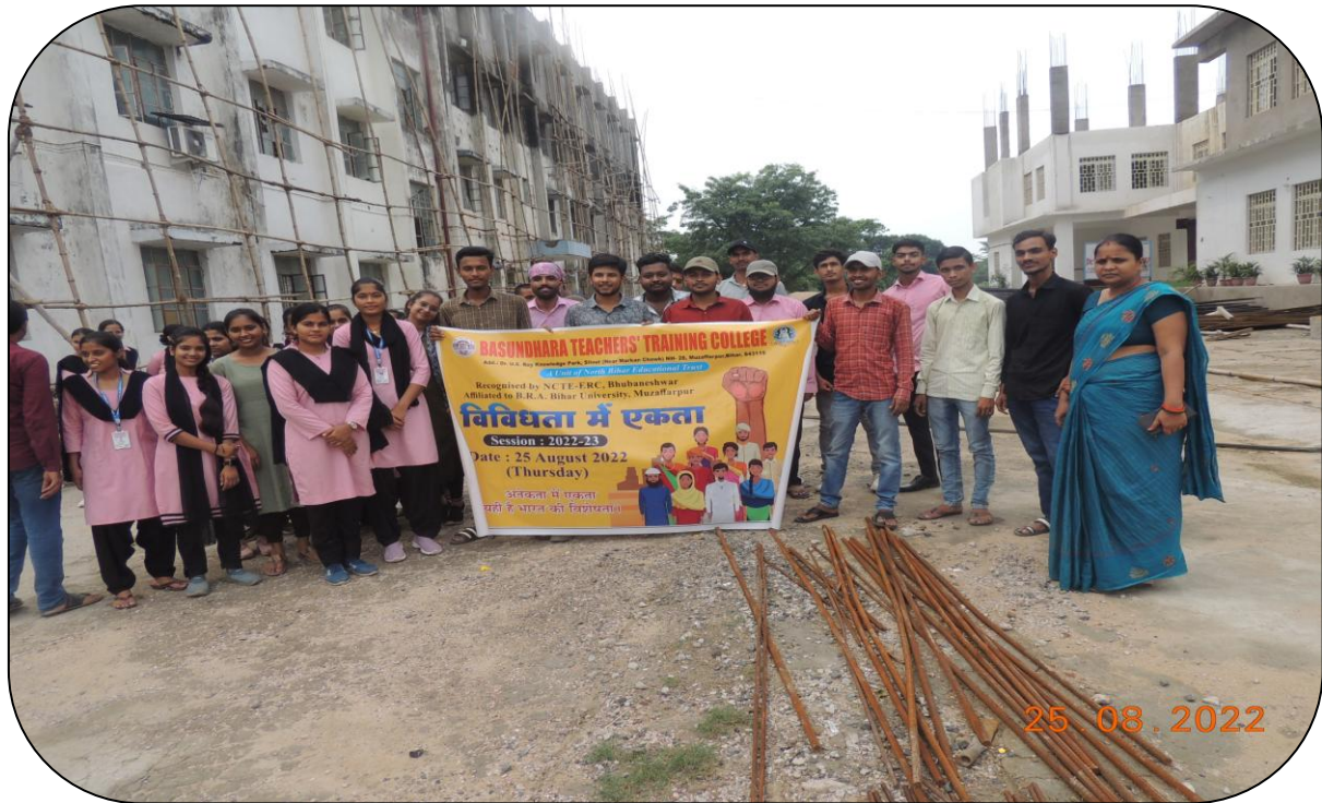
Students and faculty during rally event 25-08-2022