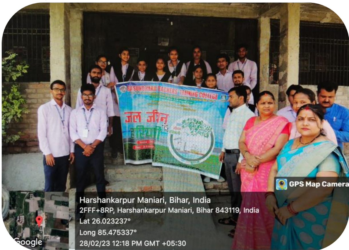
Students making awareness around villages for Save Water 28-02-2023