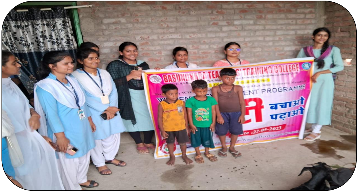
Peoples getting knowledge about "Beti Bachao Beti Padhao" through this awareness programme. May 22, 2023

Faculty members delivered speeches highlighting the significance of educating girls, the challenges faced by girls in accessing education, and the positive impact of empowered women on society. Their speeches were motivating and provided valuable insights into the importance of gender equality.