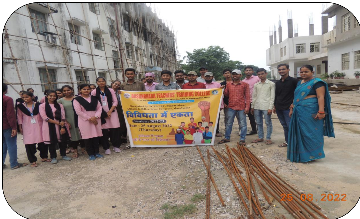
Students interacting with villagers during awareness rally programme on 25-08-2022

The rally encouraged active participation from the community, with villagers joining in the celebrations and sharing their thoughts on unity and diversity. Interactive sessions were held where community members discussed their cultural backgrounds and experiences, fostering a deeper understanding and appreciation of each other's heritage.