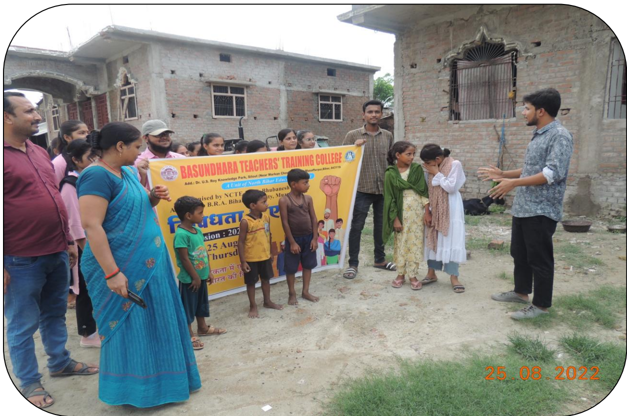
Students intracting with villagers during awareneess rallyprogramme on 25-08-2022