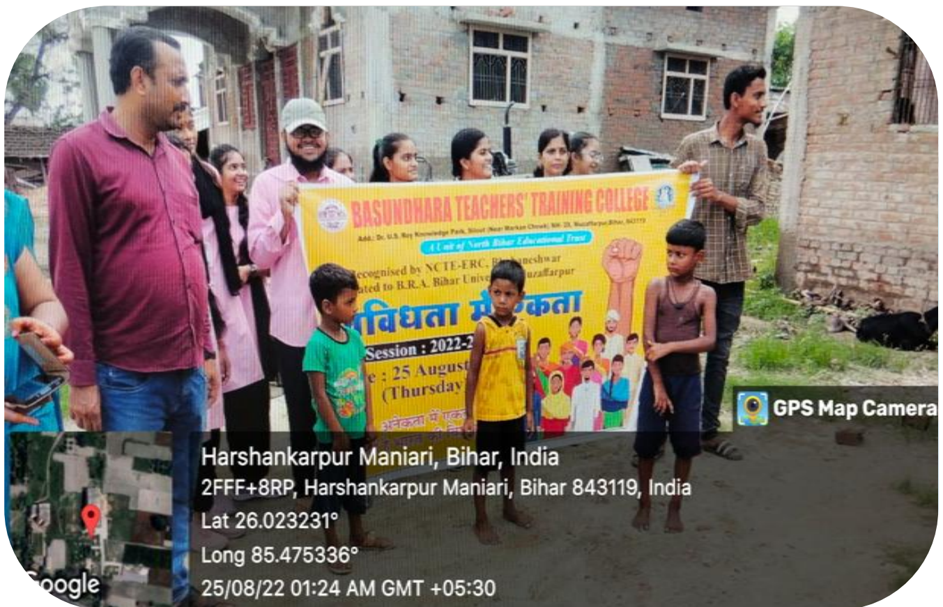
Students and faculty during rally on 25-08-2022