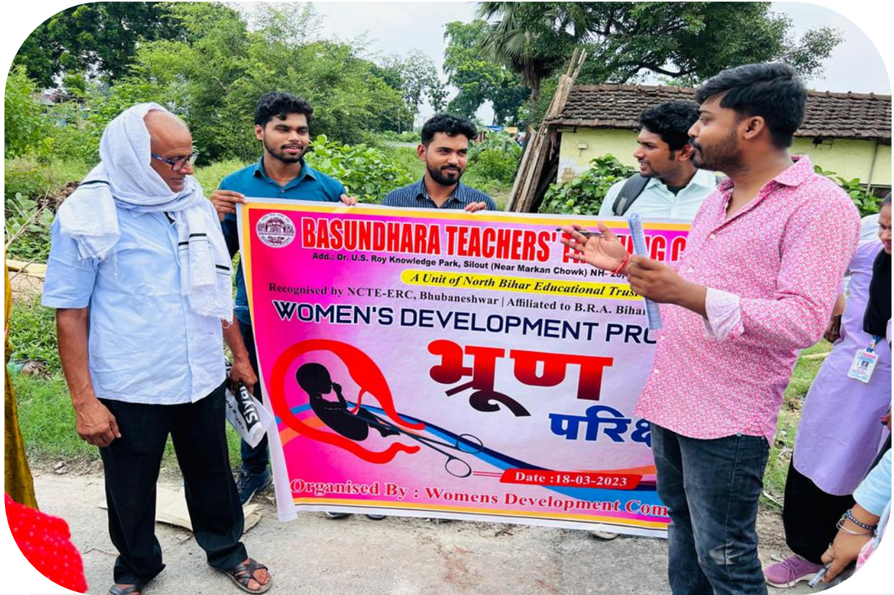
Students and faculty during rally event March 18, 2023

The BTTC extends its heartfelt thanks to all participants and supporters for their dedication and enthusiasm. Special thanks to the local resident for their cooperation and support in making the event a success.