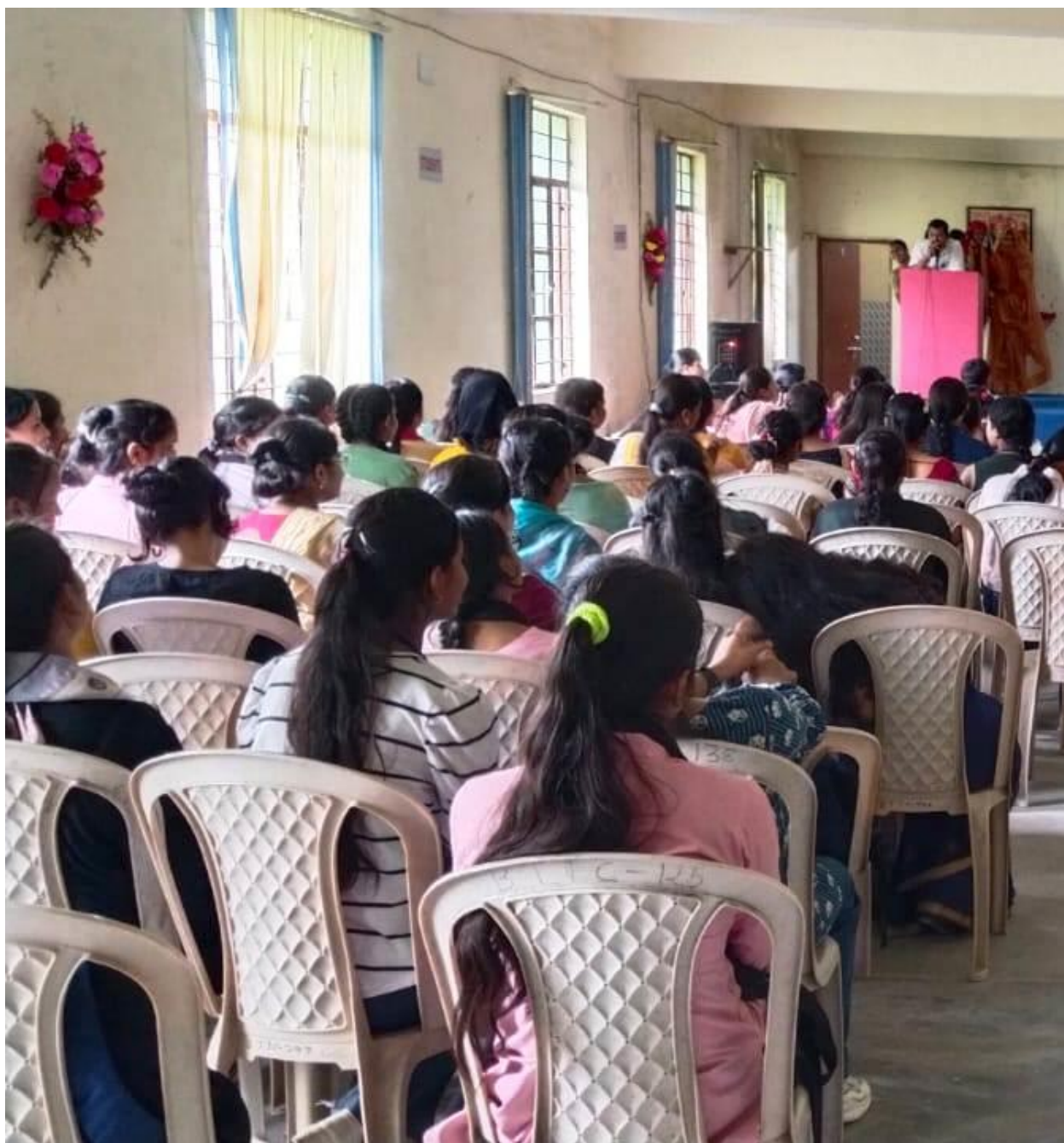
Course Coordinator Giving Brief Description of the Objective of the course

Principals Principal Basundhara Teachers Training College, Sitout Muzaffarpur, Bihar