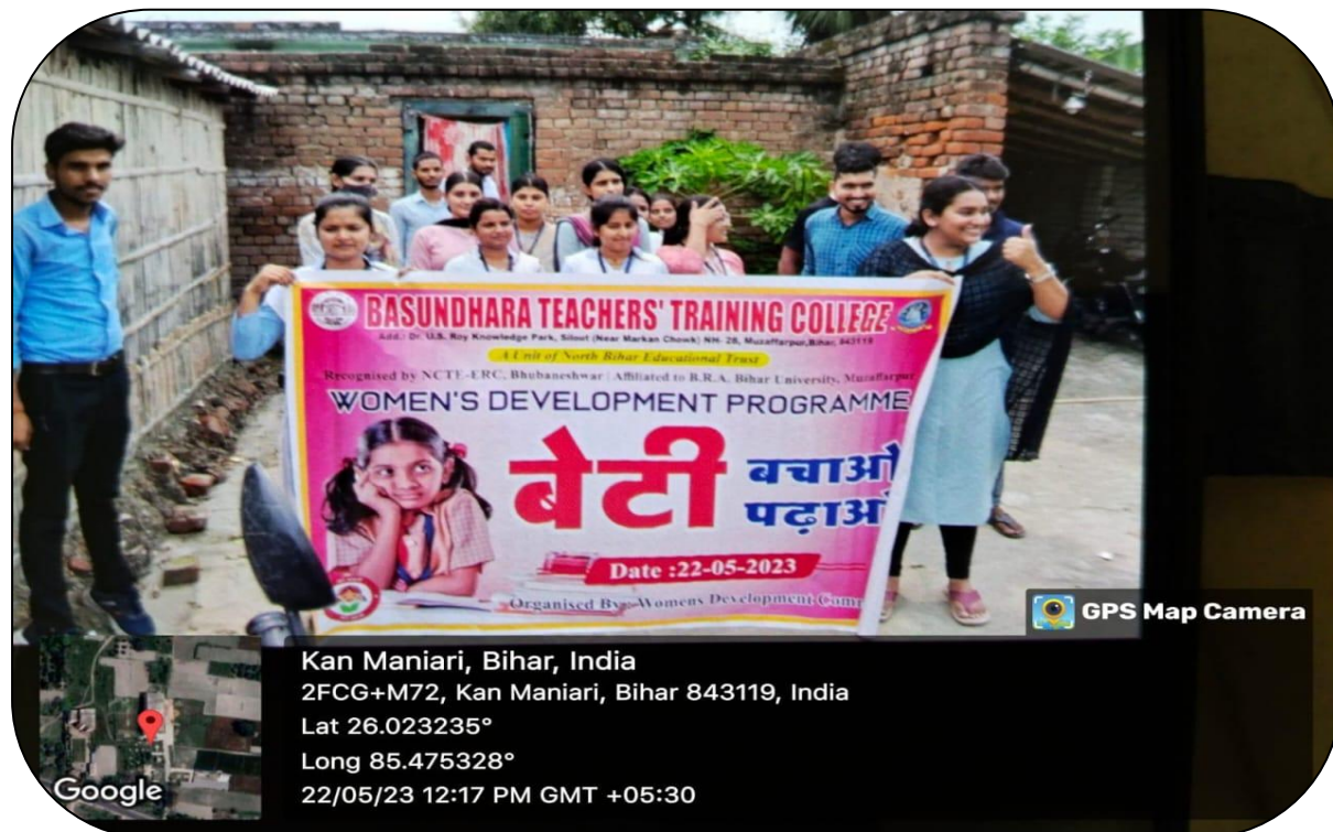
Students During awareness rally programme May 22, 2023