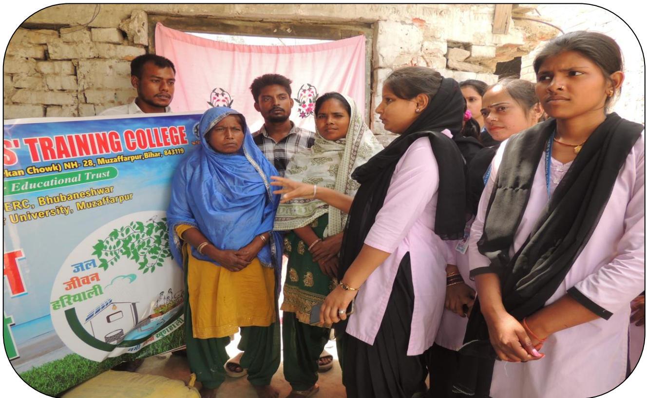
Students making awareness around villages for Save Water 28-02-2023